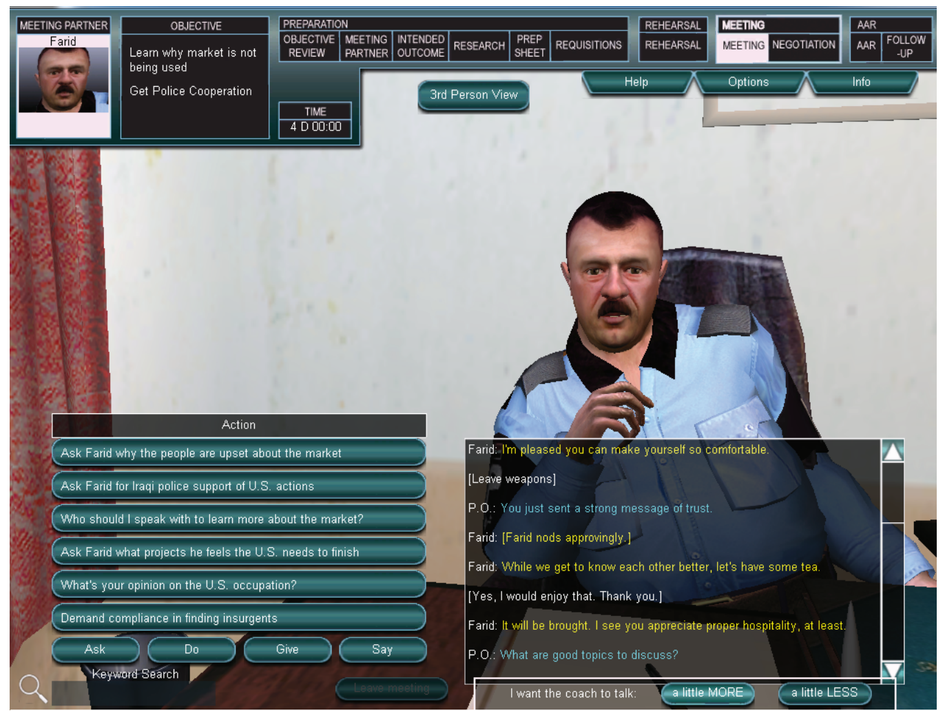
Figure 1. A meeting in BiLAT. In the transcript pane (bottom right), the feedback from the ITS-driven coach appears as blue text. Below that are buttons used to adjust how frequently the coach (P. O., above) decides to intervene (Experiments 2 and 3).

features may directly interfere, or may simply underscore that the player is using the game to achieve the external goal, as opposed to playing the game because it is fun.